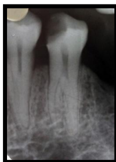
Fig 1- Preoperative radiograph

A 35-year-old patient presented with pain in the lower right side of mandible. The diagnostic radiograph revealed a carious tooth 45 [Fig.1]. The tooth was symptomatic and tender on percussion. The diagnosis was symptomatic irreversible pulpitis with apical periodontitis in relation to the mandibular second premolar. On careful evaluation of the diagnostic radiograph, it was seen that in the mandibular premolar, an extra root was present. Local anesthesia was administered and rubber dam was placed. Access was achieved using a round diamond bur. The two orifices were located one buccal and one lingual. One more orifice located mesiobuccally was also found. Its presence was confirmed with a radiograph. The working length was established radiographically for all the three canals [Fig.2]. Chemo mechanical preparation was performed using the ProTaper File system (Dentsply-Maillefer, Ballaigues, Switzerland) in a crown-down manner. A 5.25% solution of sodium hypochlorite and 17% EDTA was used alternatively as irrigants at every change of instrument. The apical preparation was done till the F2 file size in all the 3 canals and the canals were obturated with corresponding ProTaper F2cones. A postobturation radiograph was recorded [Fig.3].