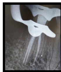
Fig 3- Obturation and Post obturation